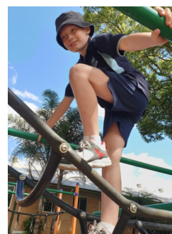
Class 1/2 Gross motor, balance and special awareness.