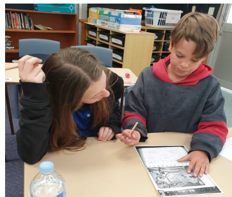
Class 5/6 working hard on there Geography and map reading abilities.