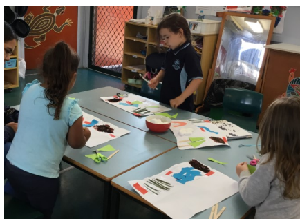
In the Transition room this week, our pre-schoolers are practicing their fine motor skills.